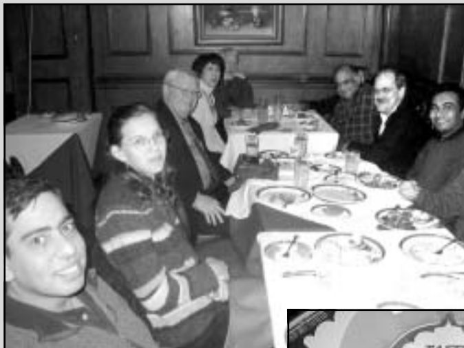
Above: DC Curry Club Right: Seattle Curry Club