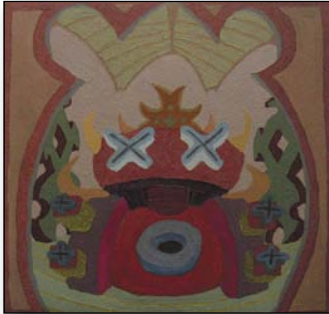
The Guardian Acrylic on Canvas 12x12½ inches 2005