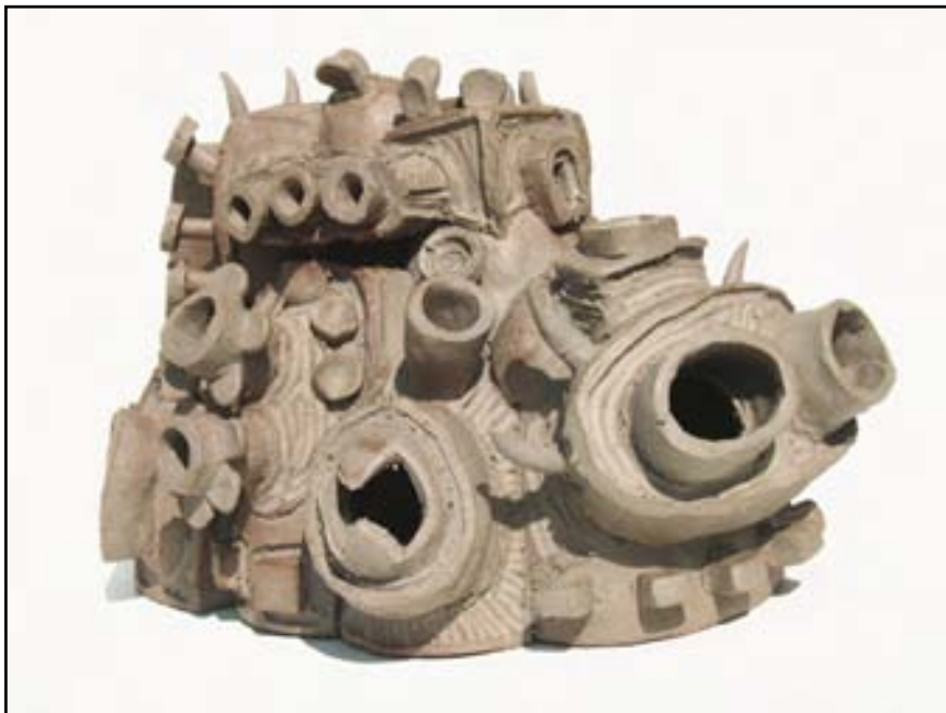
The False Stoneware 10x8x8 inches 2006