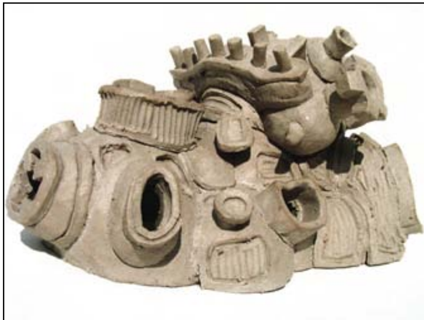
The End Stoneware 7x9x6 inches 2006