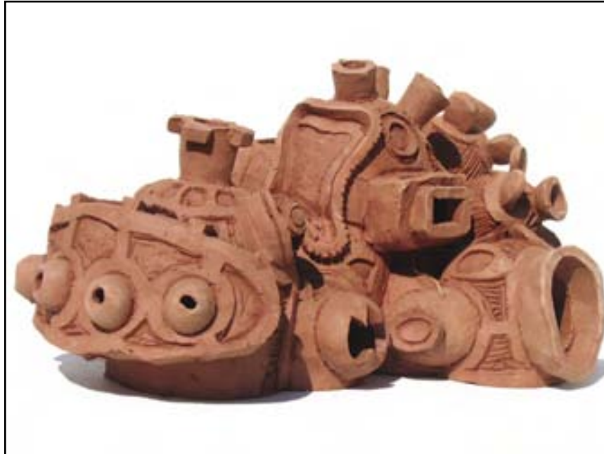
The Void TerraCotta 6x10x6 inches 2005