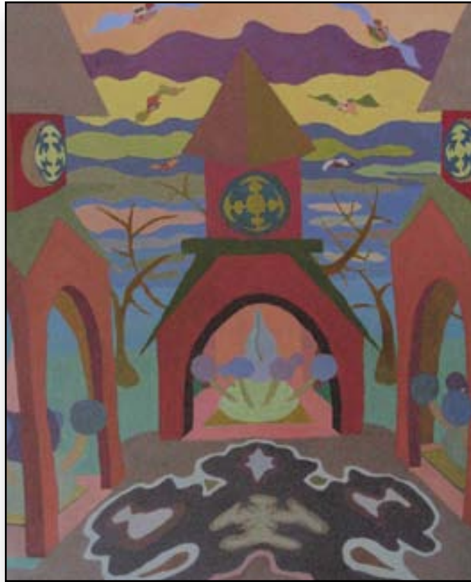
The Tower Acrylic on Canvas 3x4 feet 2005