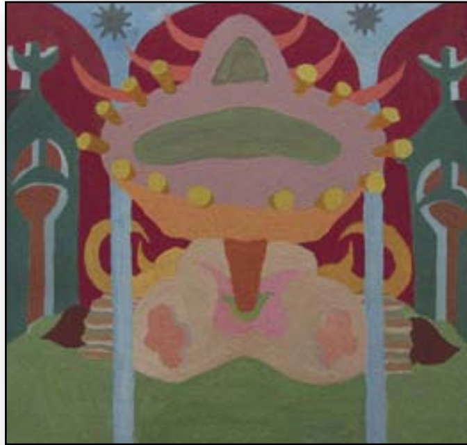
The Right Acrylic on Canvas 12x12½ inches 2005