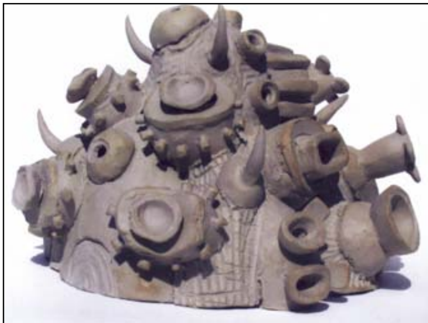
The Liar Stoneware 7x10x8 inches 2006