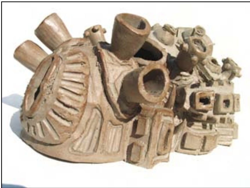
The Weak Stoneware 12x8x8 inches 2006